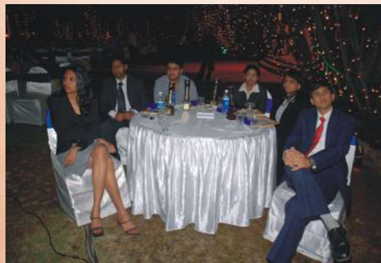
The CRISIL Young Thought Leaders of 2007