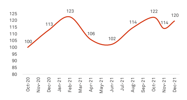
CRISFrex The CRISIL pan-India freight index

A first-of-its-kind index in India, CRISFrex not only captures the changes in freight rates on a sequential basis, but also tracks the free cash flow, or FCF, (pre-EMI) of transporters on an ongoing basis. Typically, higher FCF improves demand for commercial vehicles.