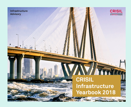
*CRISIL Infrastructure Advisory is now known as CRISIL Market Intelligence & Analytics – Consulting