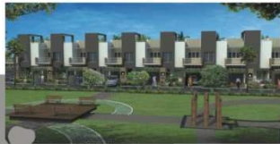
GT Capital Homes