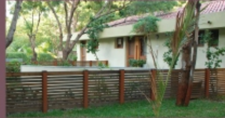
SURAMYA - SEVEN

RAJPATH CLUB → SHILAJ → PALODIYA ← SANAND