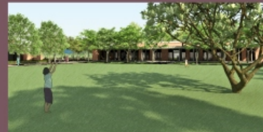
WELL MANICURED GREEN SPACES