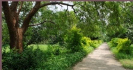
SURAMYA - GROVE