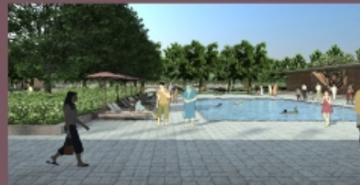
SWIMMING POOL AND CAFÉTERIA