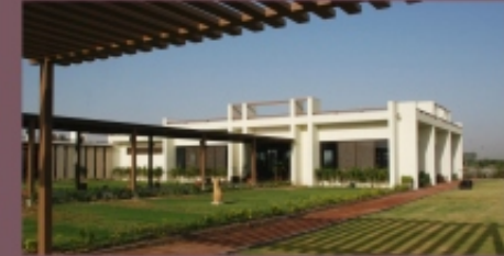
SURAMYA - LIFESPACE