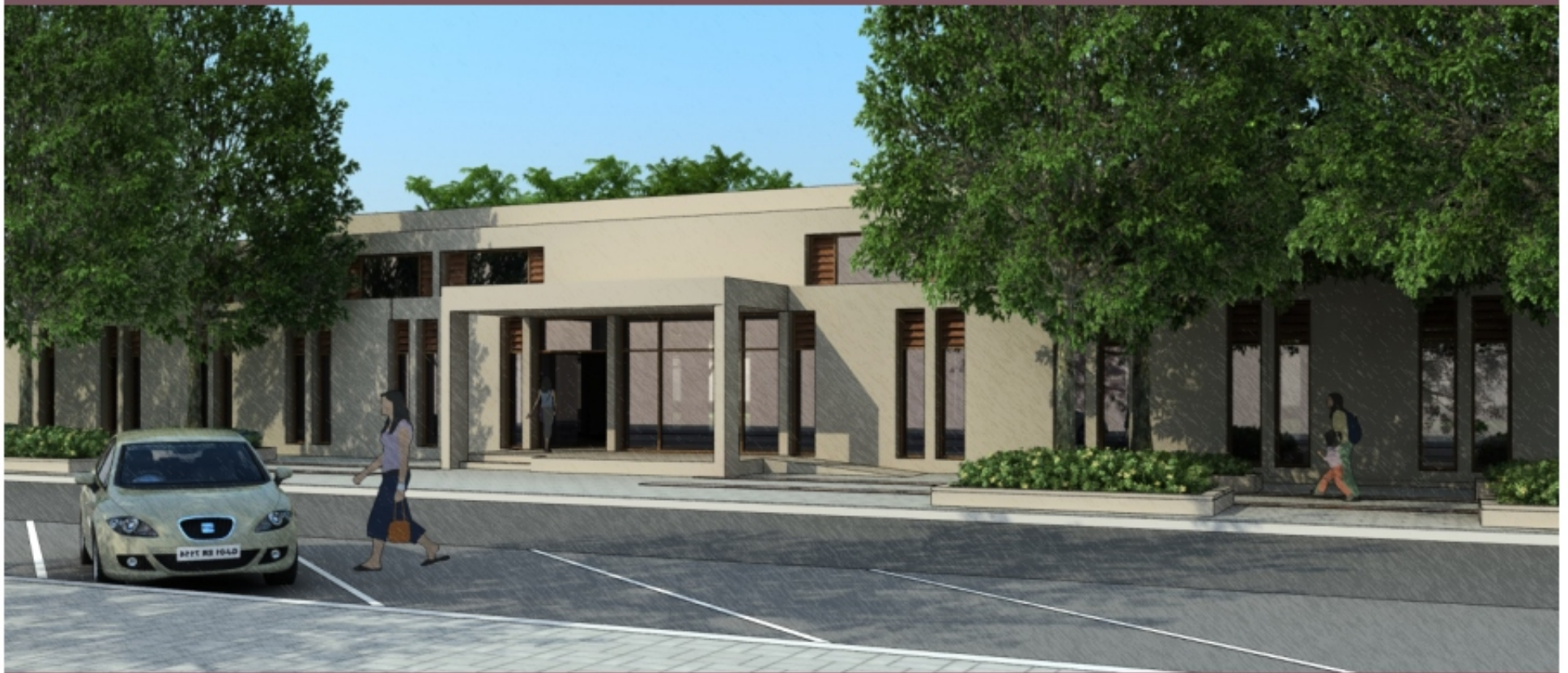
CLUB HOUSE AT SURAMYA ABODE