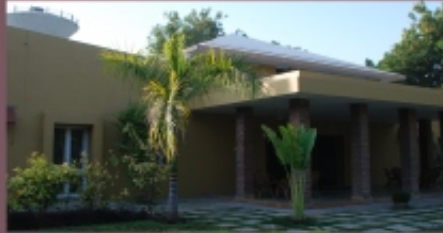
SURAMYA - THREE

RAJPATH CLUB → SHILAJ → PALODIYA ← SANAND