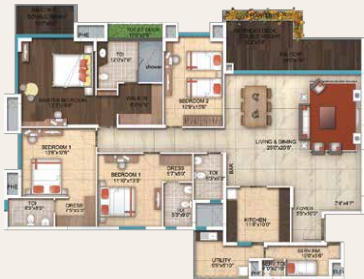
Four BHK 3187 Sq.Ft. Carpet Area 2056 Sq.Ft. | Balconies 387 Sq.Ft.