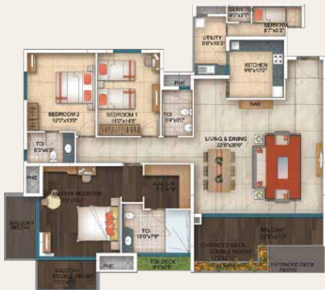
Three BHK 2565 Sq.Ft. Carpet Area 1643 Sq.Ft. | Balconies 317 Sq.Ft.