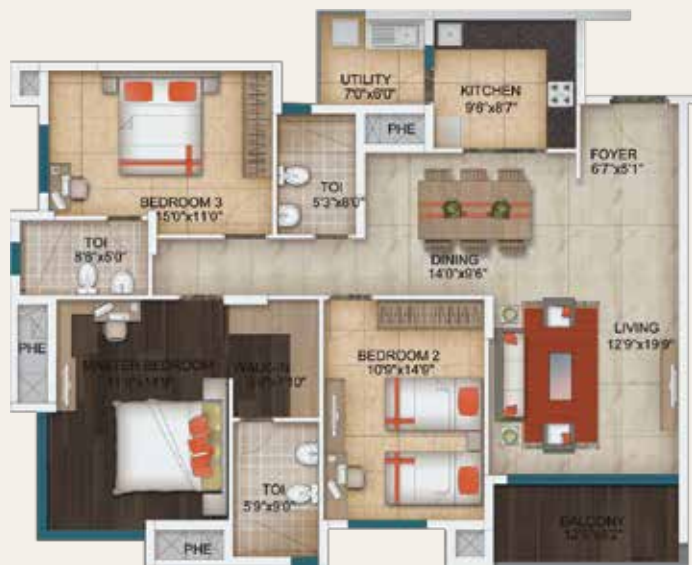
Three BHK 1779 Sq.Ft. Carpet Area 1228 Sq.Ft. | Balconies 116 Sq.Ft.