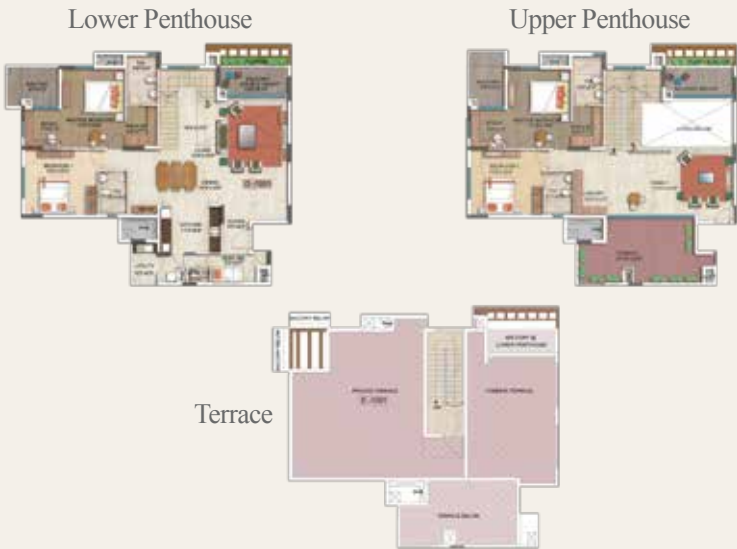
PentHouse 3911 Sq.Ft. Carpet Area 2647 Sq.Ft. | Balconies 271 Sq.Ft. | Terrace 1020 Sq.Ft.