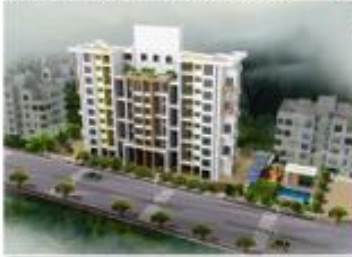
Lotus Arena, Kharadi, Pune