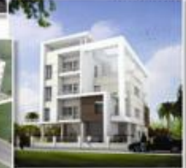
Lotus Nilaya, Amaravati