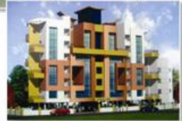
Lotus Residency, Kothrud, Pune