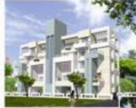
Lotus Life, Aundh, Pune