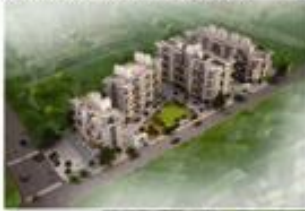
Lotus County, Ahmednagar