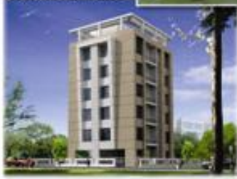
Lotus Luxor, Bharatkunj, Pune