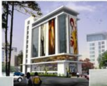
Lotus Arena, Kharadi, Pune.