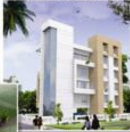
Lotus Aroma, Aundh, Pune