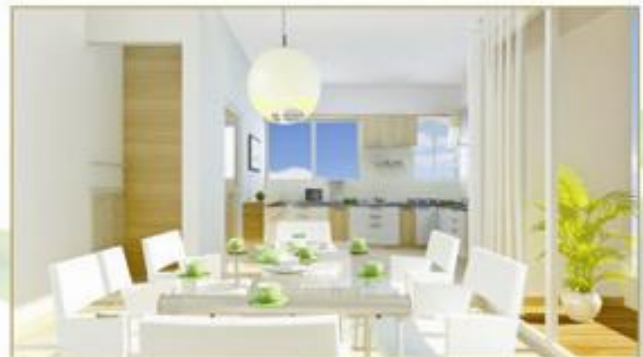
Designer Modular Kitchen