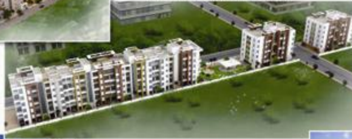
Lotus Siddhi, Aundh, Pune