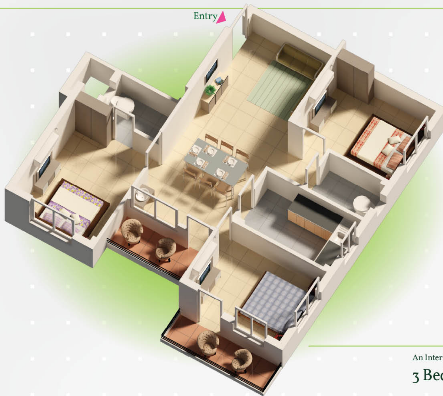
An Interior Arrangement for a 3 Bedroom Flat