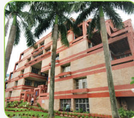
BDA Office Building