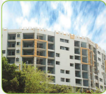
Arcon, Patia Square