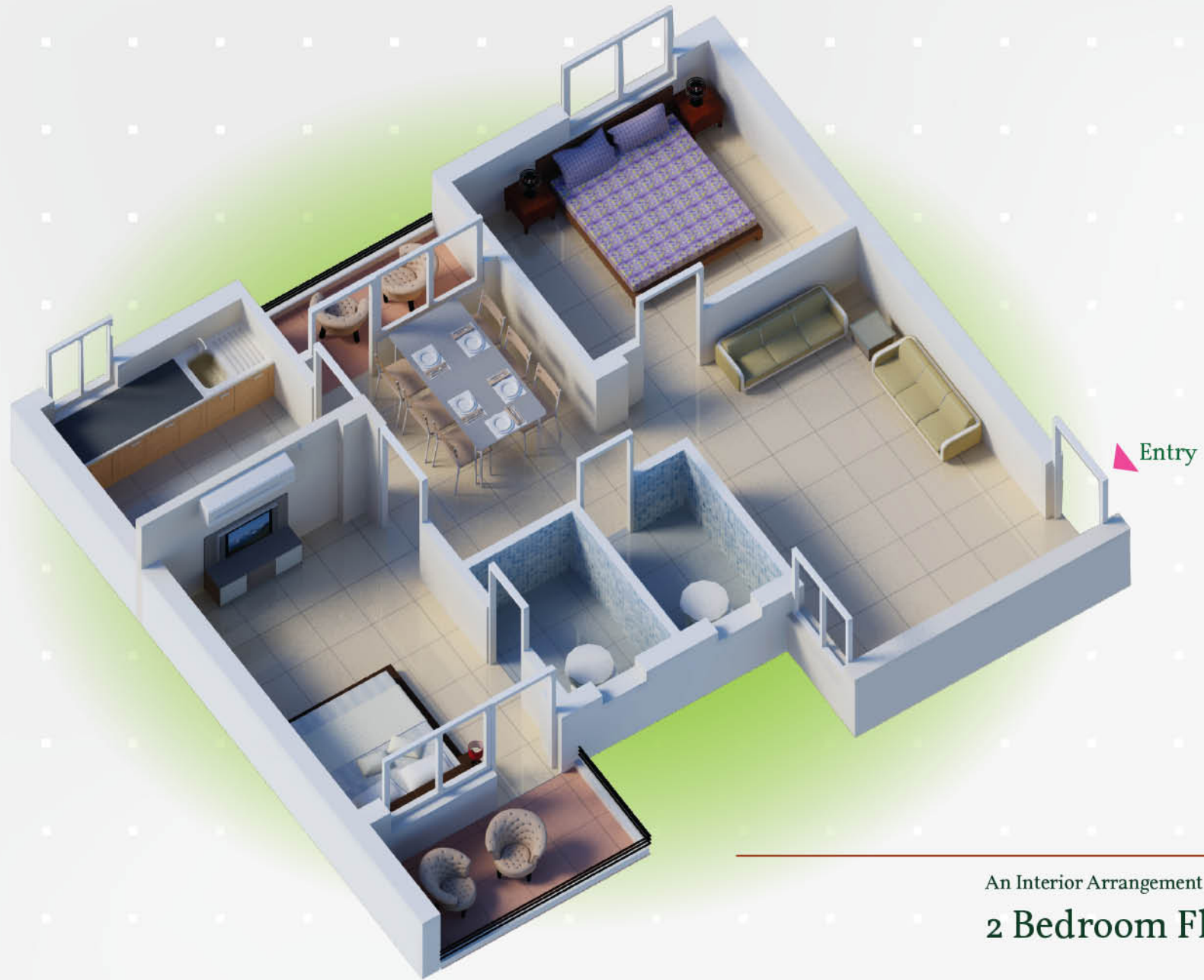
An Interior Arrangement for a 2 Bedroom Flat