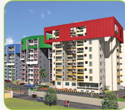
Gymkhana Palm Heights