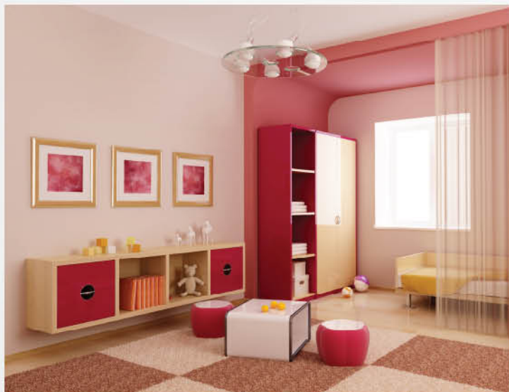
An Interior Arrangement for a 1 Bedroom Flat