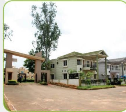
Gymkhana Palm Residency