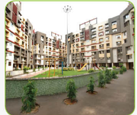
BMC Bhawani Saheed Nagar Enclave