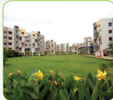
SBI Staff Association Co. Op. Ltd. Housing, Kesura, Bhubaneswar