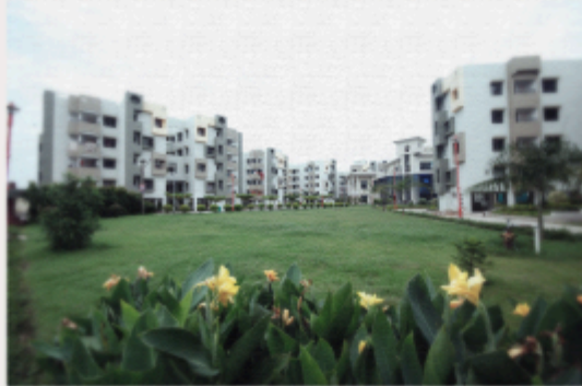
SBI Staff Housing