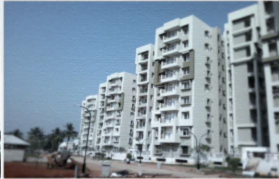
Gymkhana Palm Heights