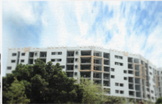
Acron, Patla Square

Acrux performance is crafted in steel and Glass. Acrux structures bear testimony to the quest for perfection.