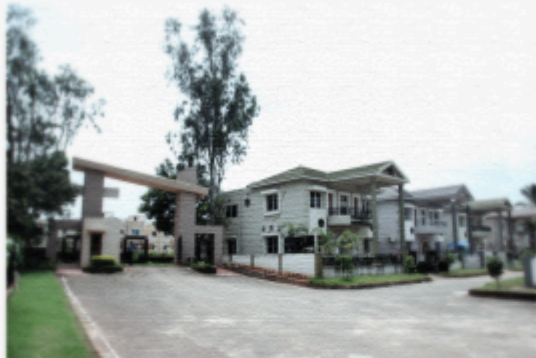
Gymkhana Palm Residency