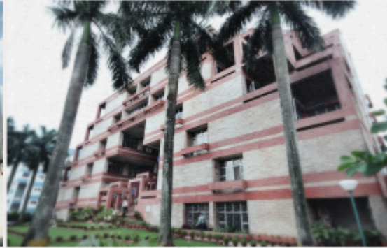
BDA Office Building