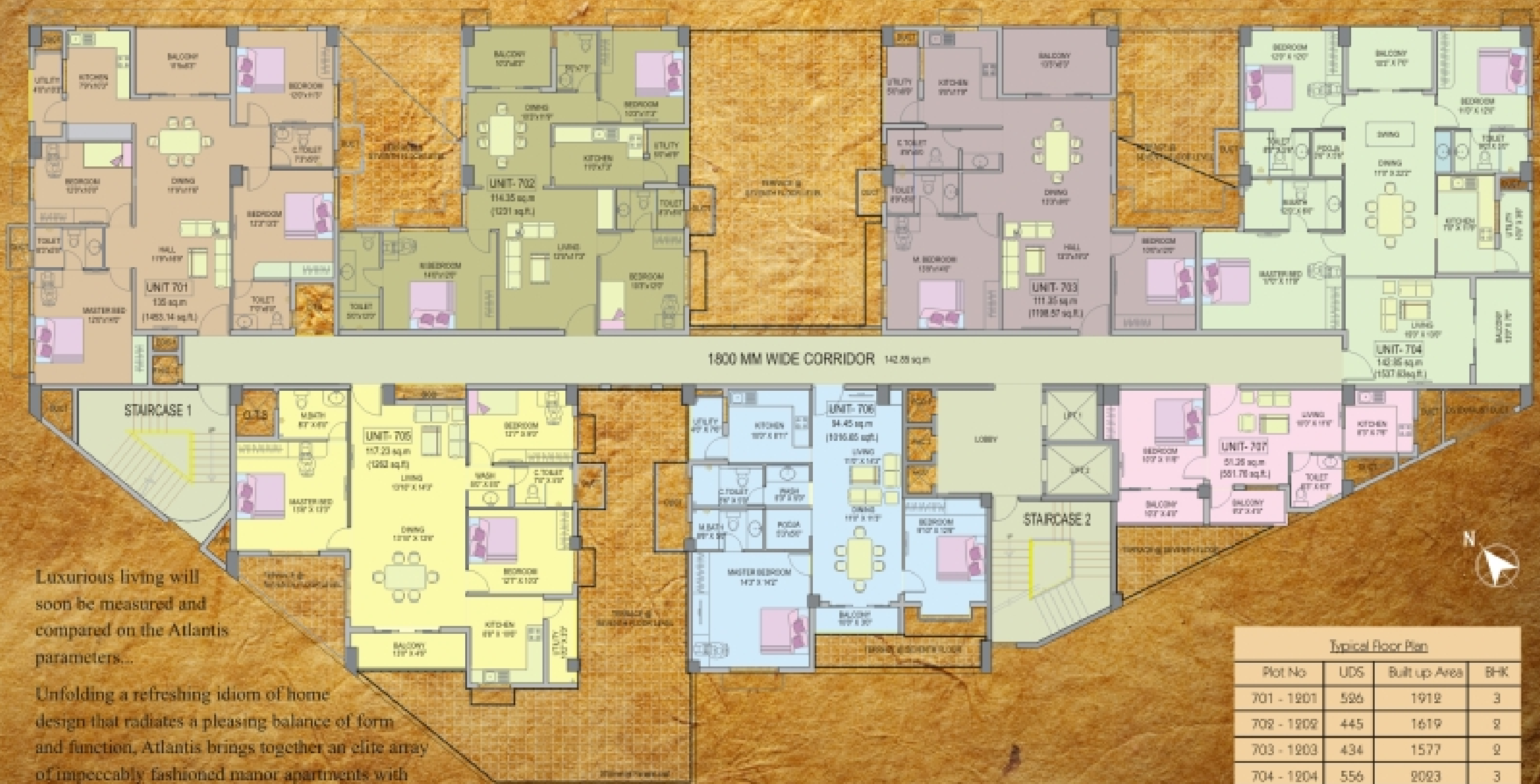
Typical Floor Plan (7th - 12th floor)