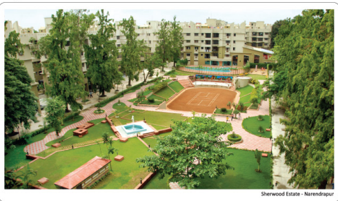
Sherwood Estate - Narendrapur