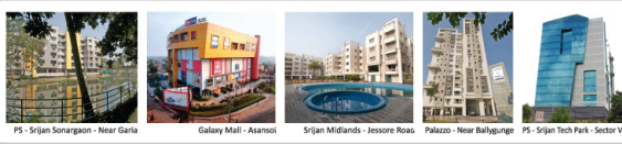
PS - Srijan Sonargaon - Near Garia