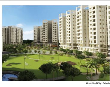
Greenfield City - Behala