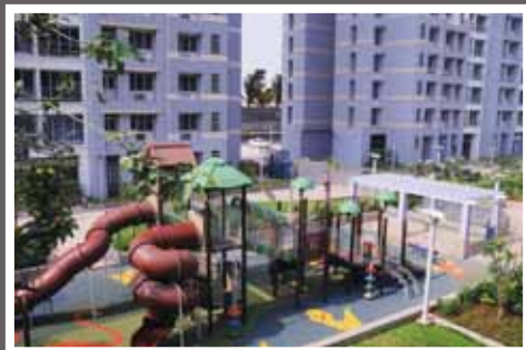
Childrens Play Park