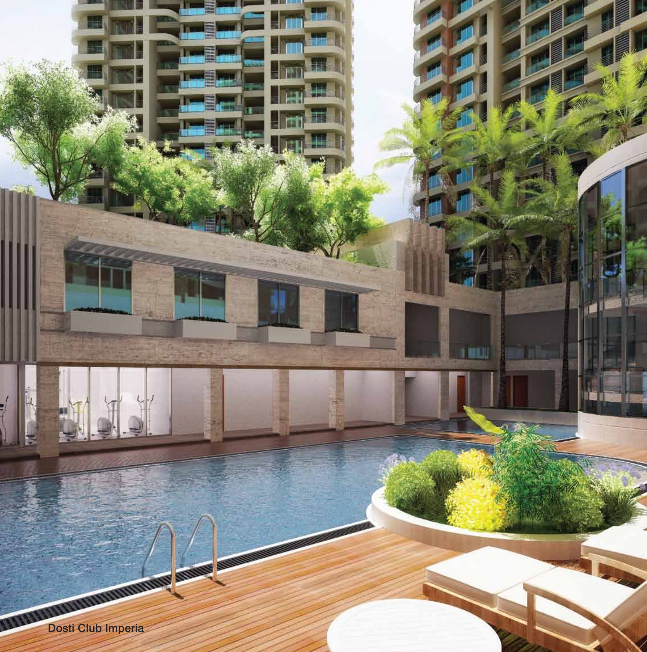
Dosti Club Imperia