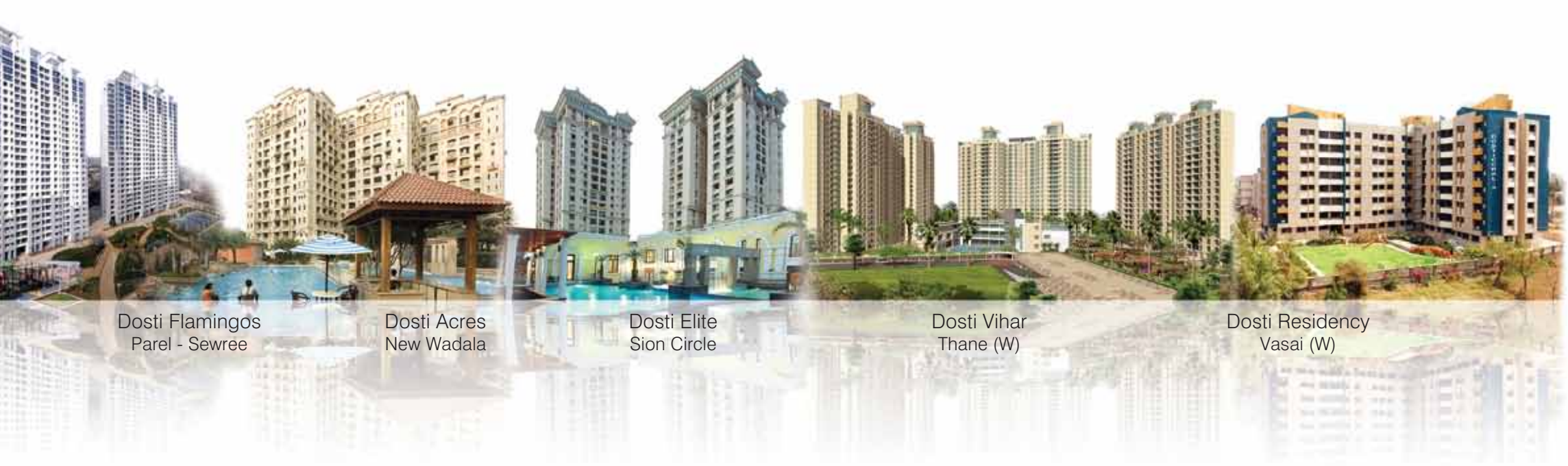
Dosti Flamingos Parel - Sewree

Geared as always to meet the customer requirements, Dosti Group is all set to garner its construction prowess to trail blaze the commercial skyline of Mumbai with a foray into Commercial, Retail, IT Parks and SEZs.