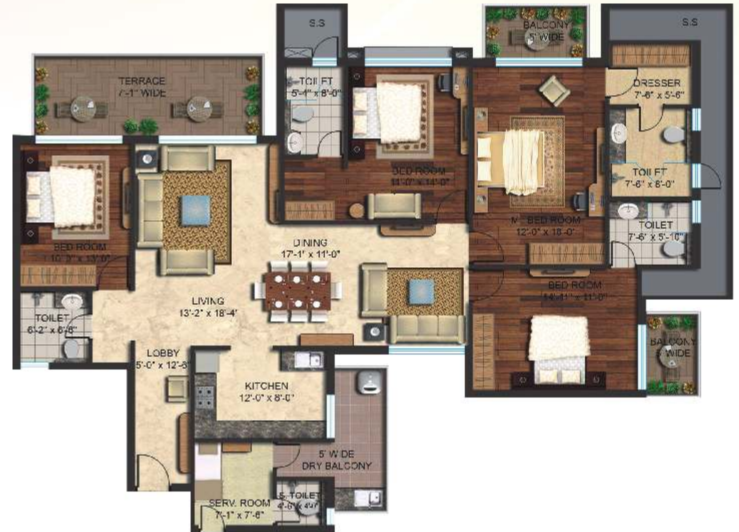
Super Area - 2710 sq. ft. 4BHK + 4T + SR + TERRACE

Disclaimer : In the interest of project, floor plans, layout plans, areas, dimensions and specifications are indicative and may change as decided by the company or by the competent authority.