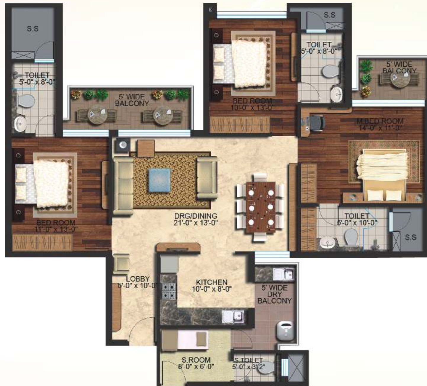
Super Area - 1815 sq. ft. 3BHK + 3T + SR

Disclaimer : In the interest of project, floor plans, layout plans, areas, dimensions and specifications are indicative and may change as decided by the company or by the competent authority.