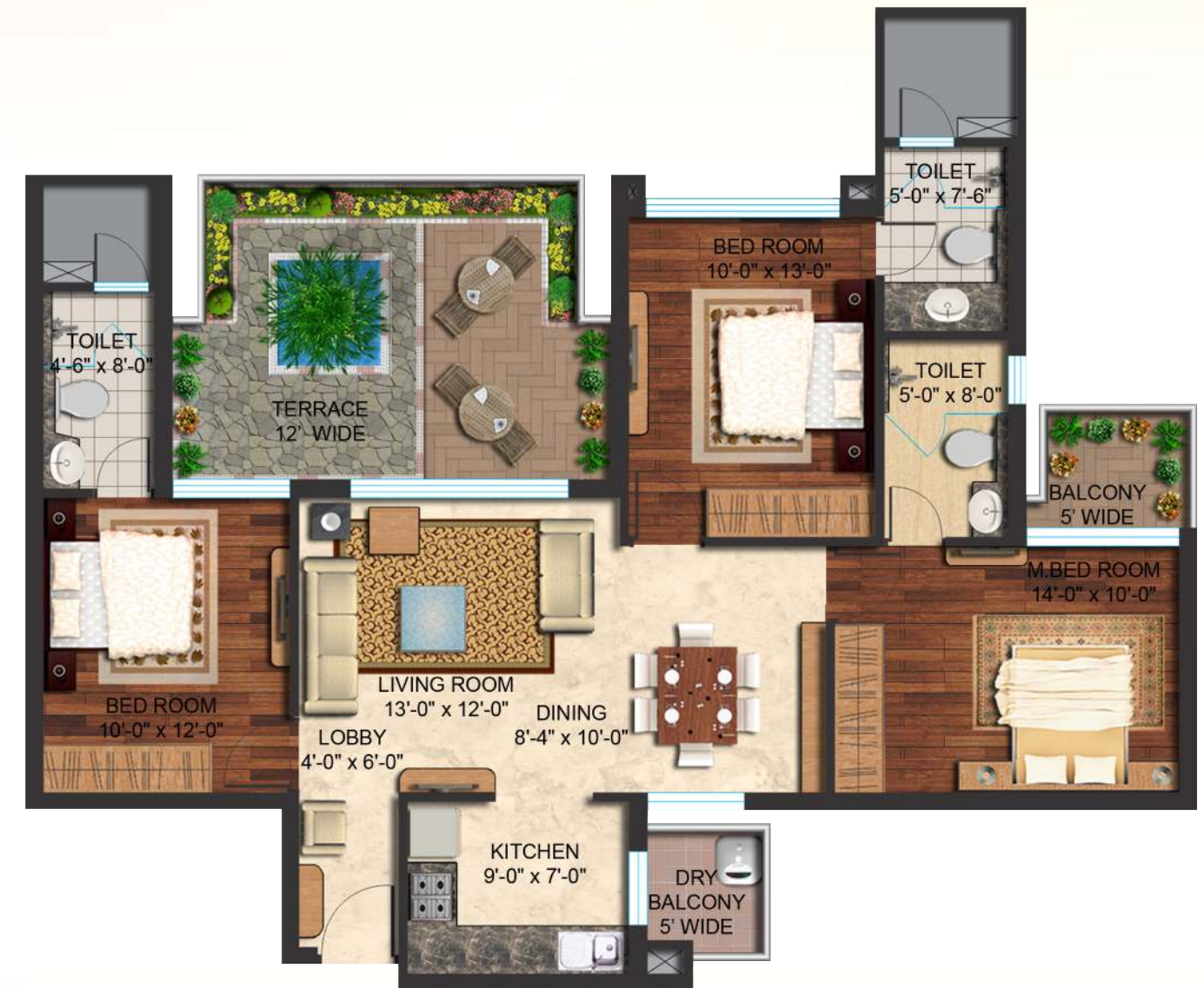
Super Area - 1620 sq. ft. 3BHK + 3T + TERRACE

Disclaimer : In the interest of project, floor plans, layout plans, areas, dimensions and specifications are indicative and may change as decided by the company or by the competent authority.