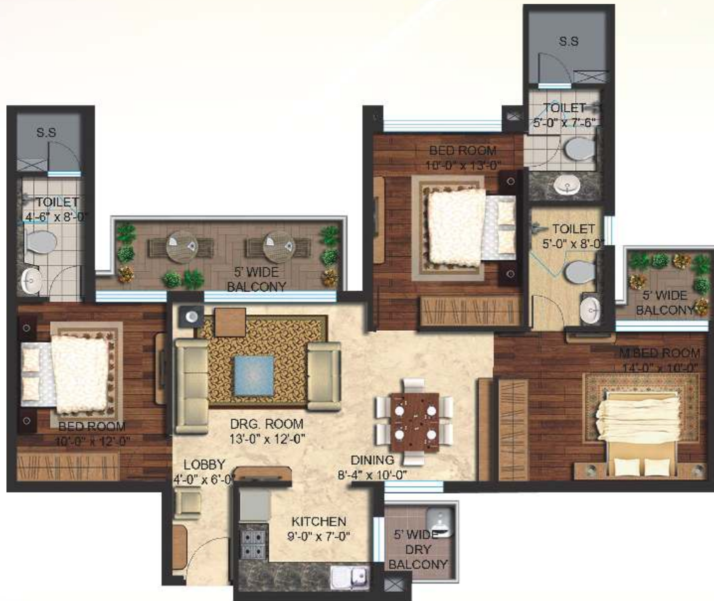
Super Area - 1490 sq. ft. 3BHK + 3T

Disclaimer : In the interest of project, floor plans, layout plans, areas, dimensions and specifications are indicative and may change as decided by the company or by the competent authority.