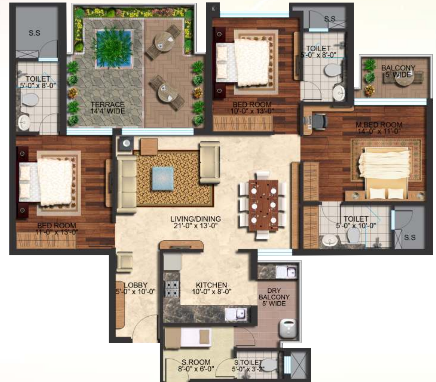
Super Area - 1960 sq. ft. 3BHK + 3T + SR + TERRACE

Disclaimer : In the interest of project, floor plans, layout plans, areas, dimensions and specifications are indicative and may change as decided by the company or by the competent authority.