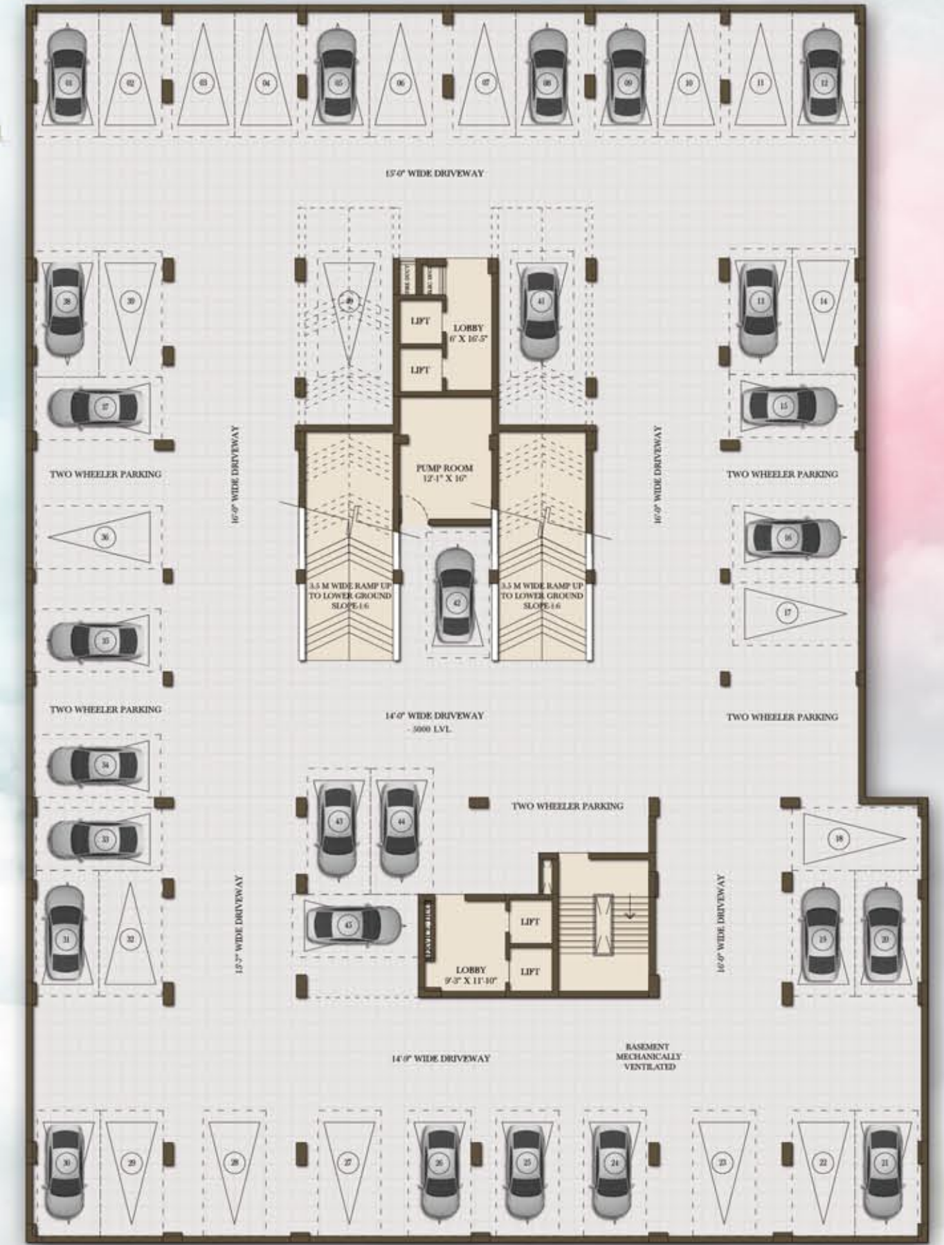
Basement Floor Plans