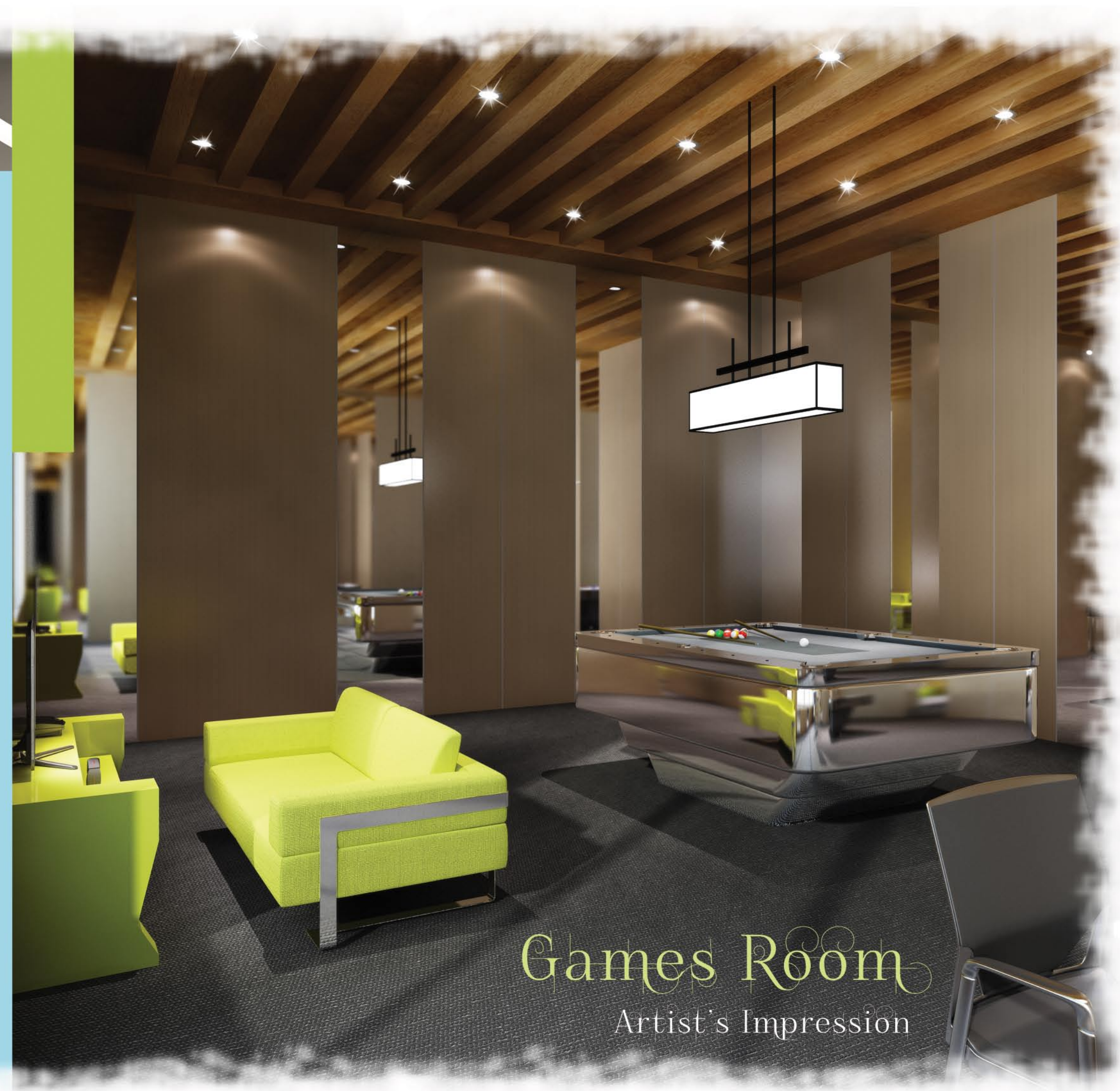
Games Room Artist's Impression