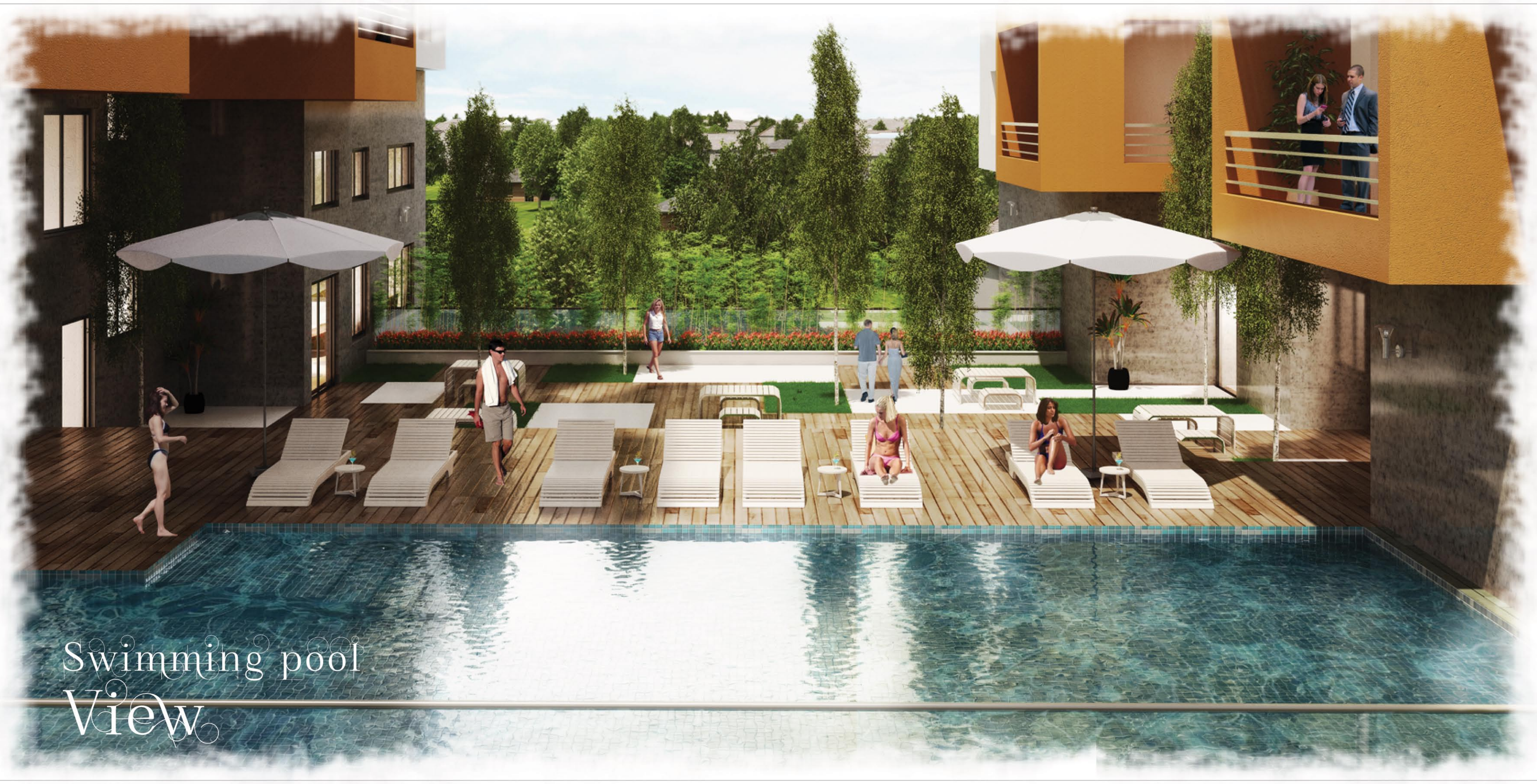
Swimming pool View