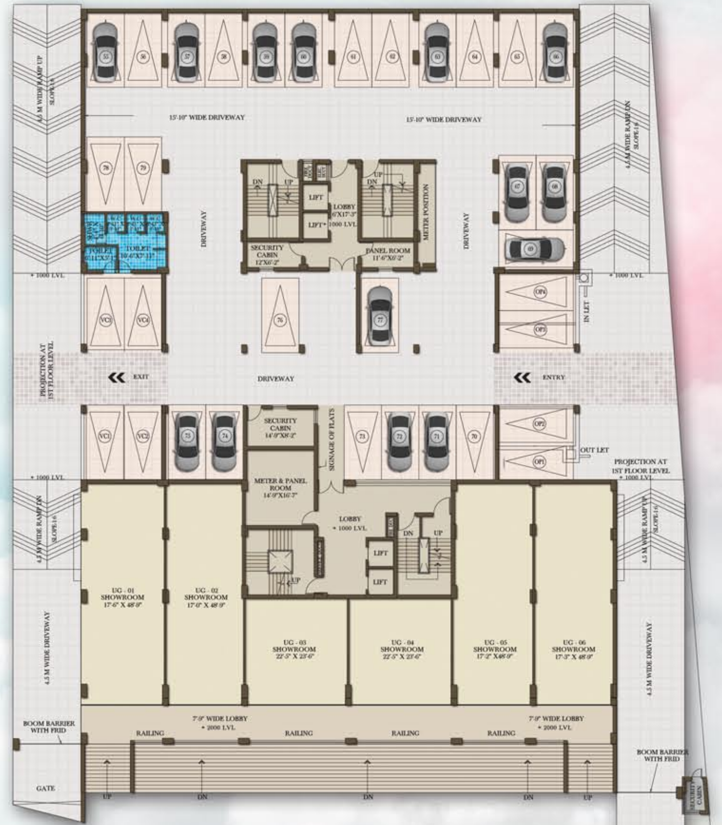
Lower Ground Plan