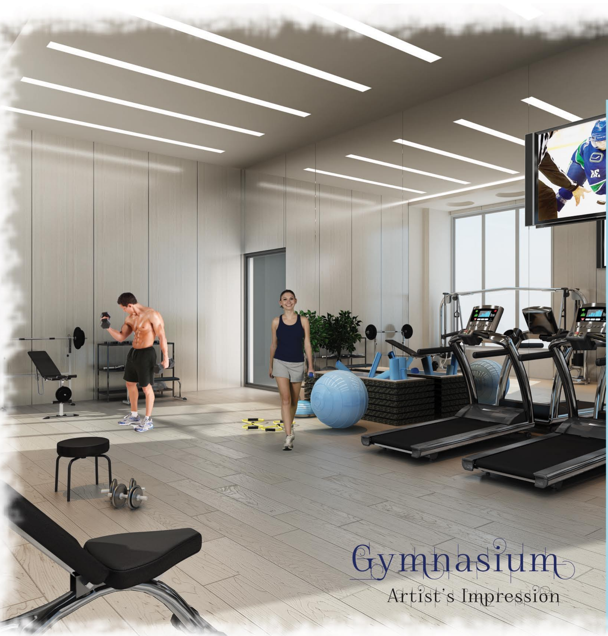
Gymnasium Artist's Impression